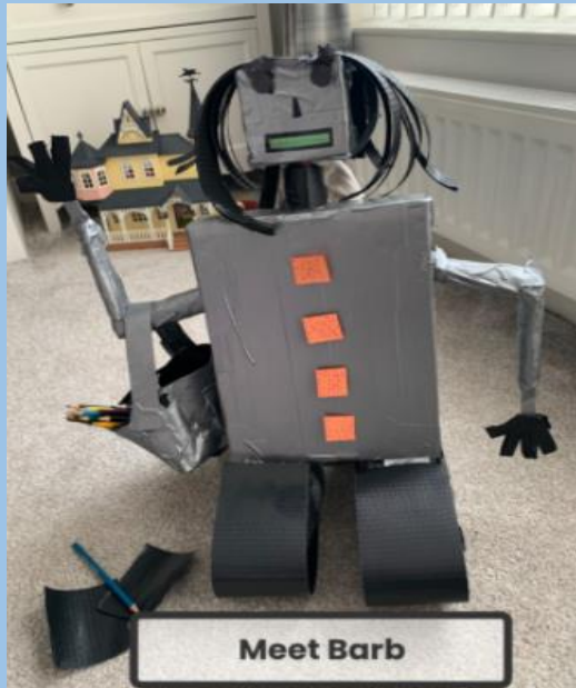
Millie made a fantastic model named Barb.

This week we have incorporated our Geography theme, with our recycled modelling, to create our own junk models. We have practiced different joining methods and even given our models a name!